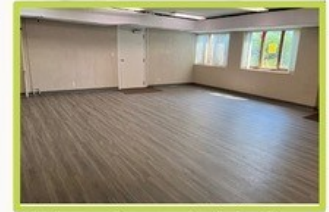
Leisure Center Activity Room