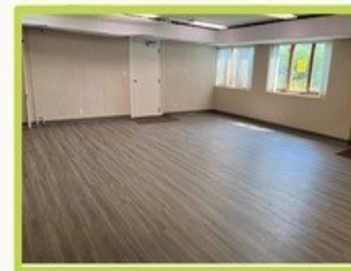
Leisure Center Activity Room